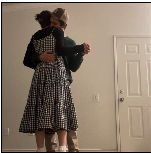
Dancing to our first dance song before leaving our home!