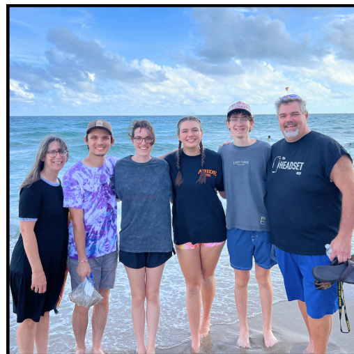
Last picture with my whole family before they left!