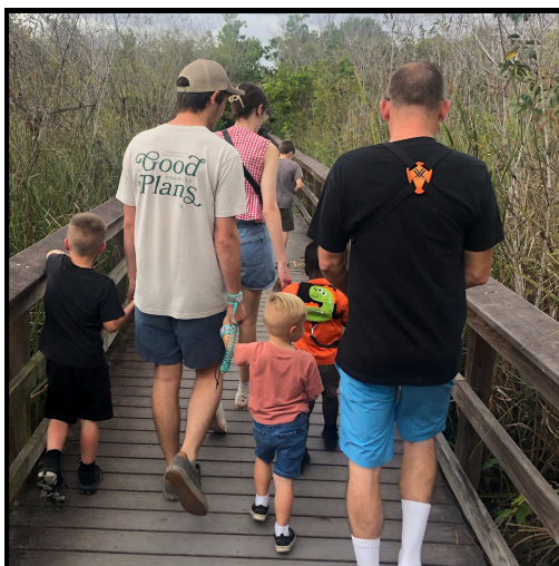
Looking for alligators! We saw so many!