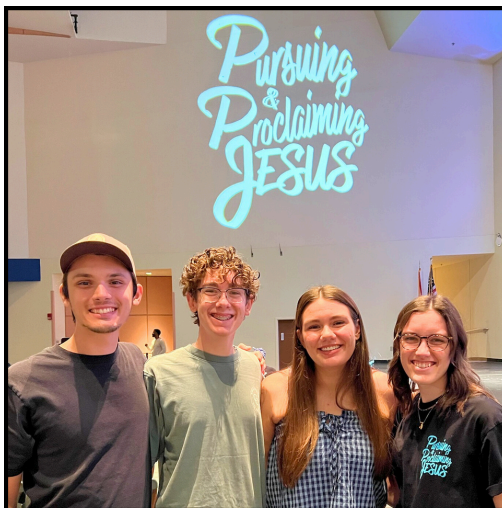
First service at our new church!