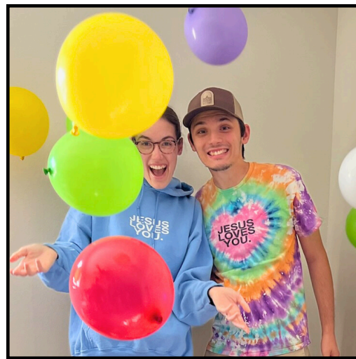
Our new home was decorated to celebrate this new season!