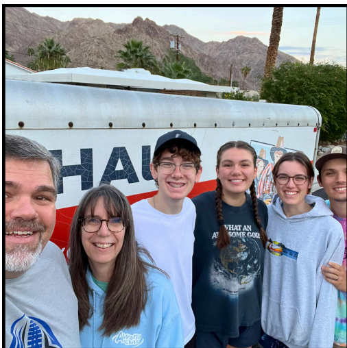
All loaded up and ready for our cross country drive!